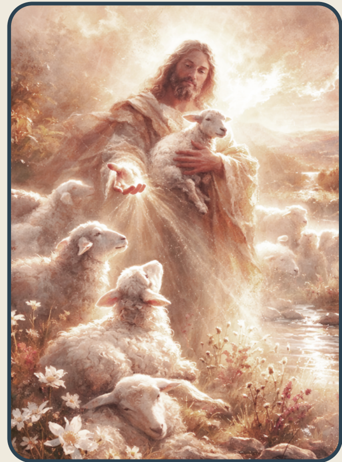
I Shall Not Want - Solace

SURELY GOODNESS AND MERCY SHALL FOLLOW ME ALL THE DAYS OF MY LIFE, AND I SHALL DWELL IN THE HOUSE OF